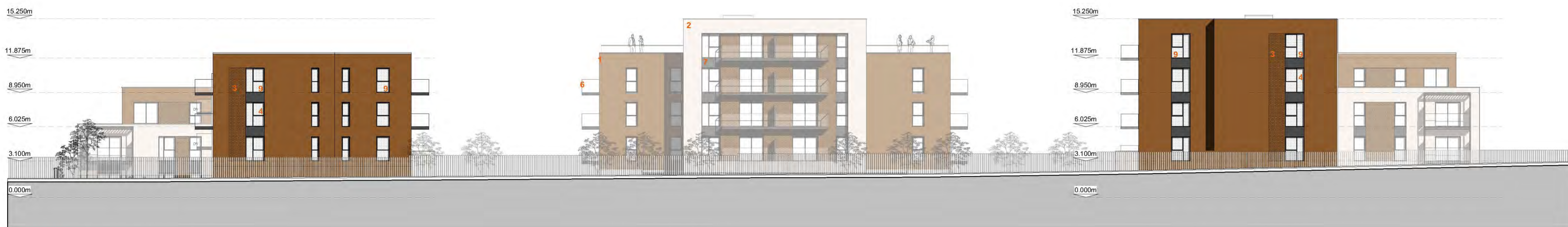
section BB block A & B - southern elevation