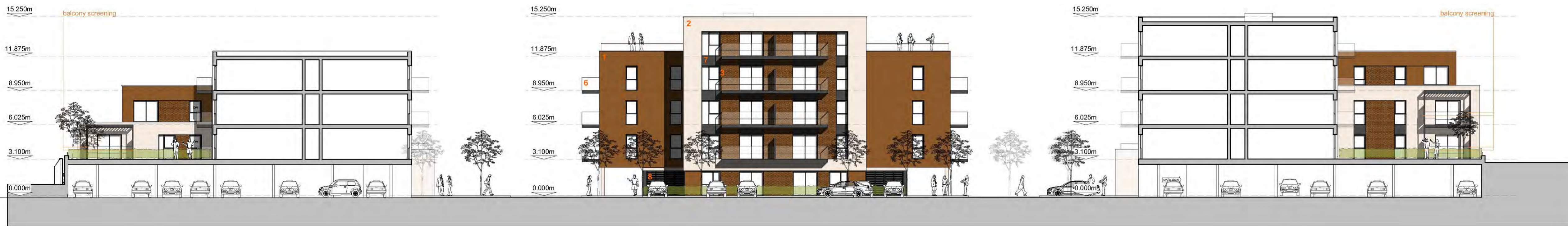
section AA block B section (block A southern elevation in the background)