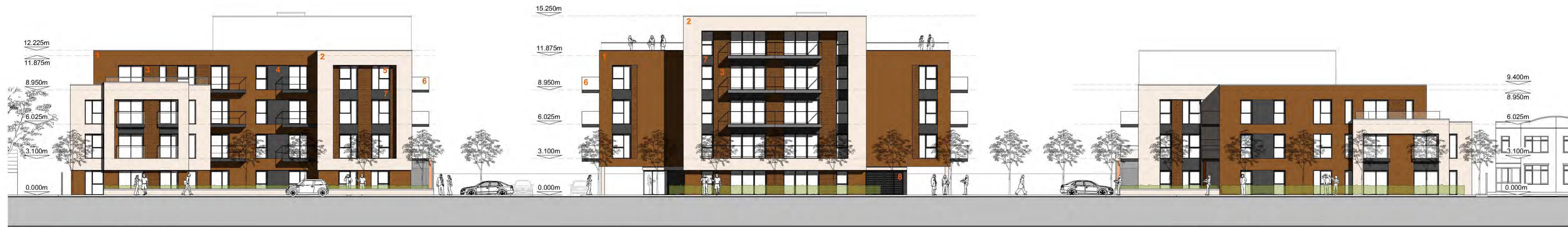
elevation 1 block D & E - northern elevation